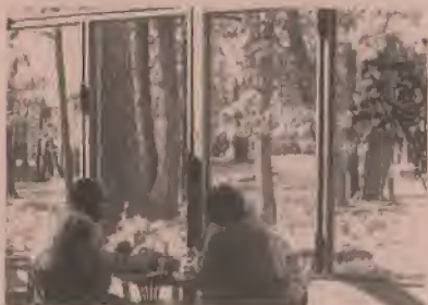
Scenic Wooded View